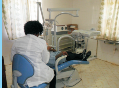
The Dental Unit at Nazareth Ruiru Hosp.

This is a branch of Nazareth Hospital and its located in Ruiru town on Alpha-Knits road off Ruiru - Kiambu road.