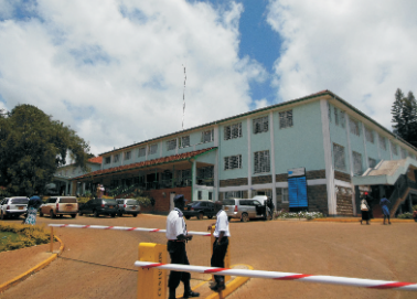
The Main Hospital (Riara Ridge)