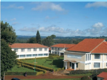
Nazareth Medical College

We take both male and female students and accommodation is provided in a very serene environment within the Nazareth Medical college compound.